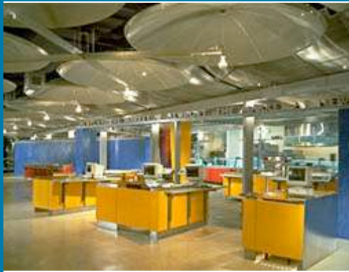
General Electric Edison Award 1996